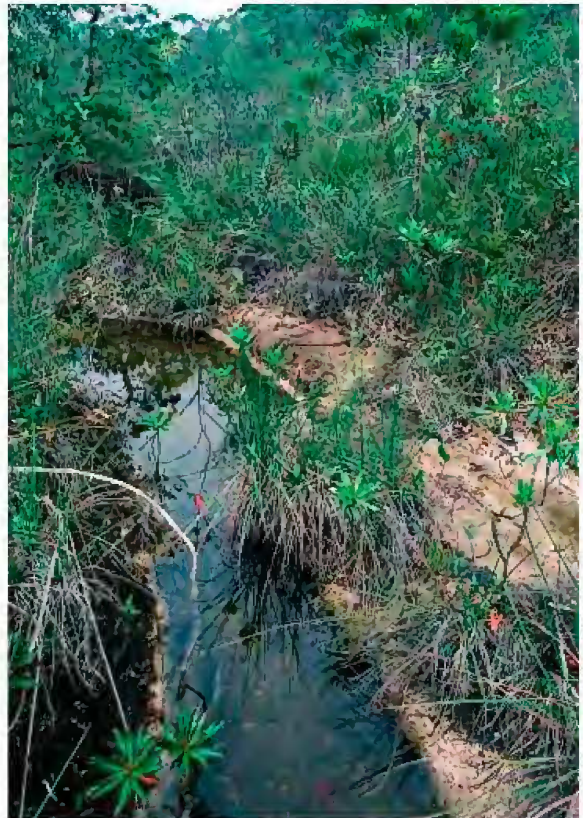
Figure 2: Typical habitat of Drosera spatulata var. bakoensis in Bako National Park.

Some populations of D. spatulata found in New Zealand have a leaf shape similar to D. spatulata var. bakoensis . This is especially true for the "alpine form" (Salmon 2001), i.e., the plants described as D. triflora Colenso (Colenso 1890), which are similar to D. spatulata var. bakoensis in terms of size and number of flowers). However, the differences between the two sets of plants are as follows (New Zealand plants in parentheses): the base of the inflorescence scape is glabrous (lower 1/4 of the scape covered by simple white hairs), slightly glandular pedicels and upper third of the scape (pedicels and upper third of the scape glabrous), petals pale pink (petals white), and the stigmatic tips cylindrical and smooth to minutely papillate (clavate and papillate). The New Zealand populations of D. spatulata need further investigation and may deserve a distinct taxonomic classification.